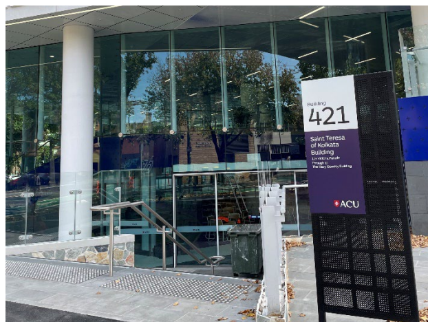
Napier St entry