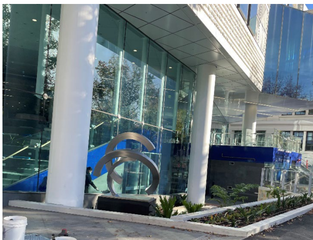
View from the corner of Victoria Pde and Napier St