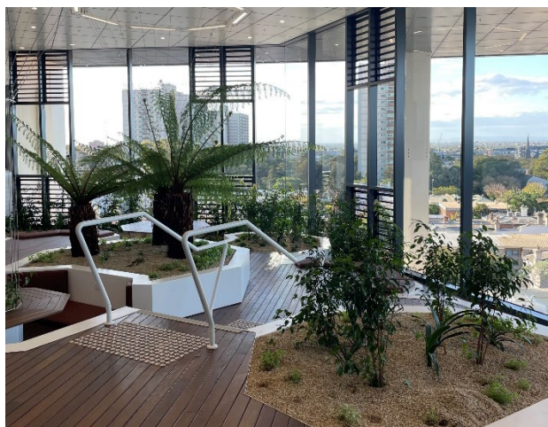
Level 5 Conservatory