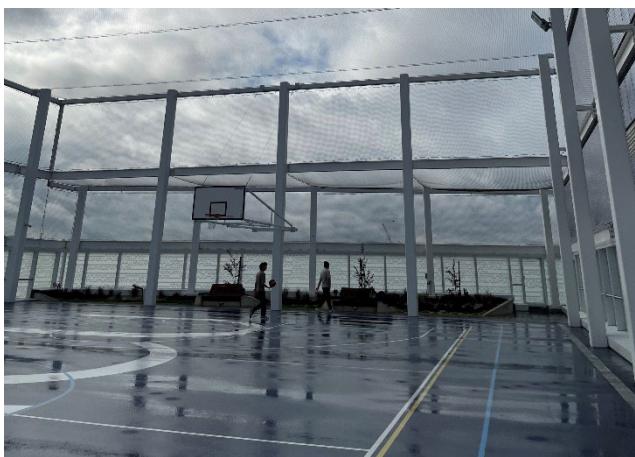
Level 8 sports court