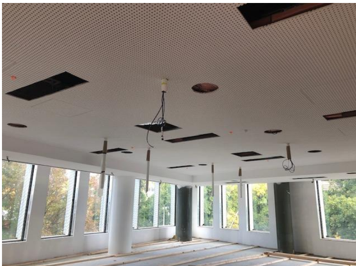
STKB Level 1 Classroom