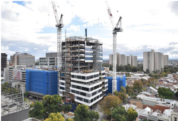
View from Camera 1