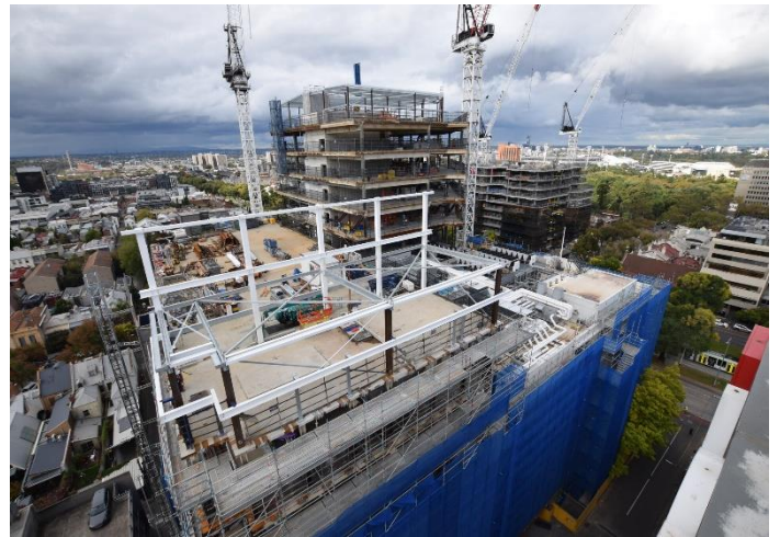
View from Camera 2