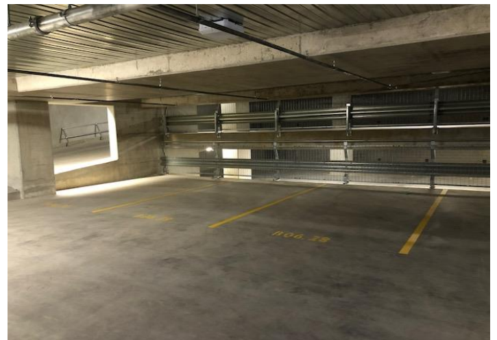
STKB Basement Carpark Line Marking