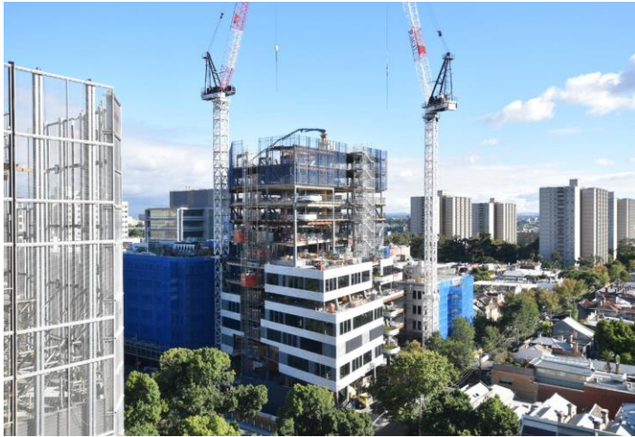
View From Camera 1