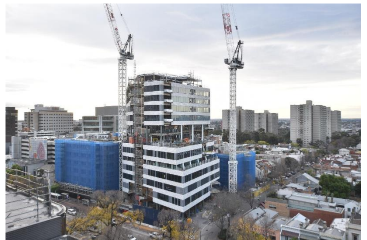
View from Camera 1