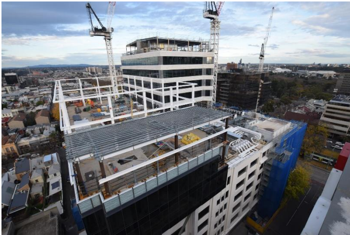
View from Camera 2