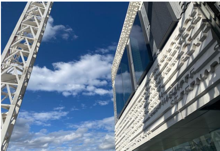
North Elevation Façade details