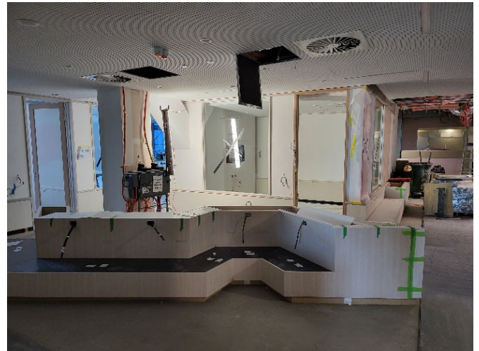
Level 3 Seating