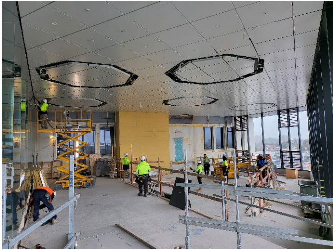
Level 5 Conservatory