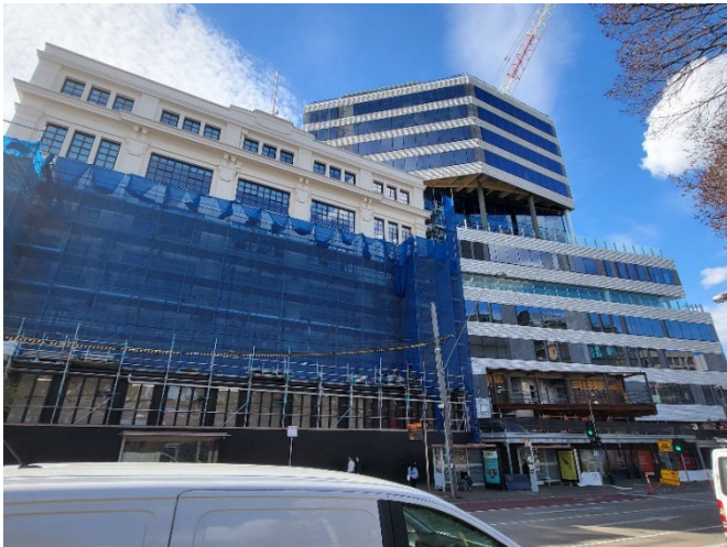
Views from Victoria Pde