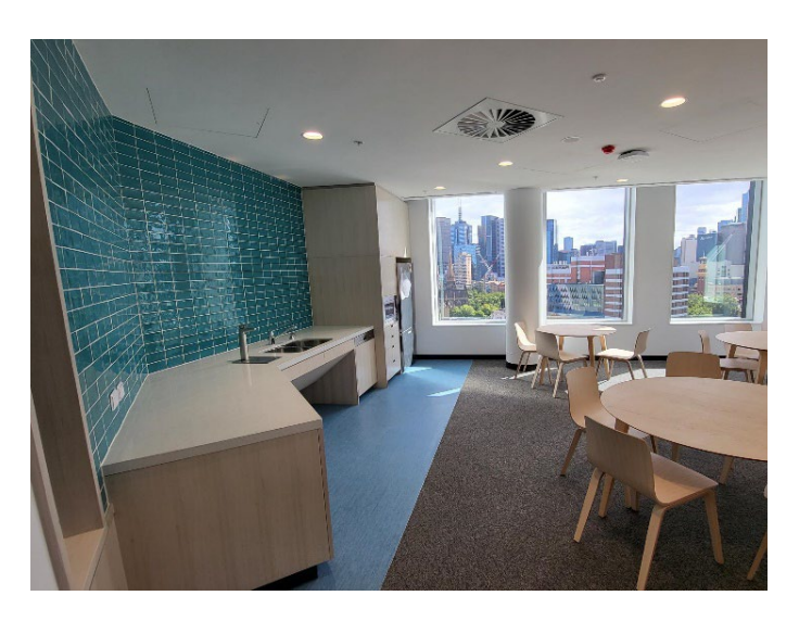
Tea room on office levels