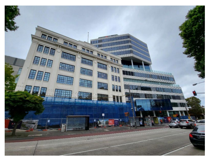
View from Victoria Pde