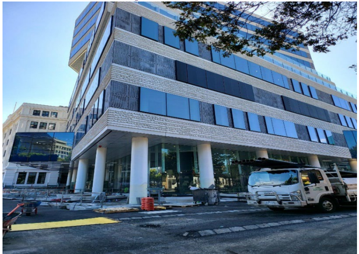
STKB from the corner of Napier St and Victoria Parade