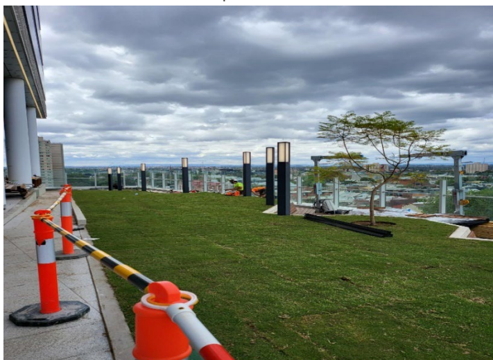
Level 6 Terrace