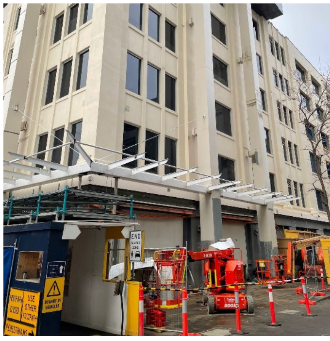
Young St Glass Canopy in progress