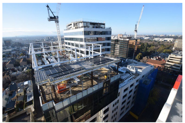
View from Camera 2