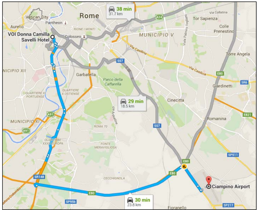
Ciampino Airport to voi Donna Camilla Savelli Hotel - Rome