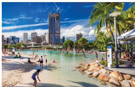
Left: Bondi Icebergs (Sydney, NSW). Top right: Flinders Street Station (Melbourne, VIC). Bottom right: South Bank (Brisbane, QLD).