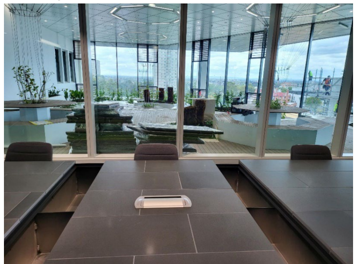
Looking towards the Level 5 Conservatory