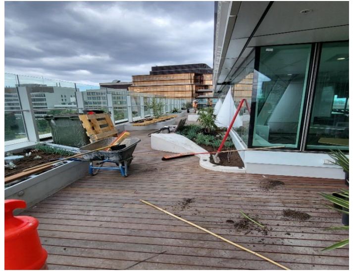
Level 4 Terrace