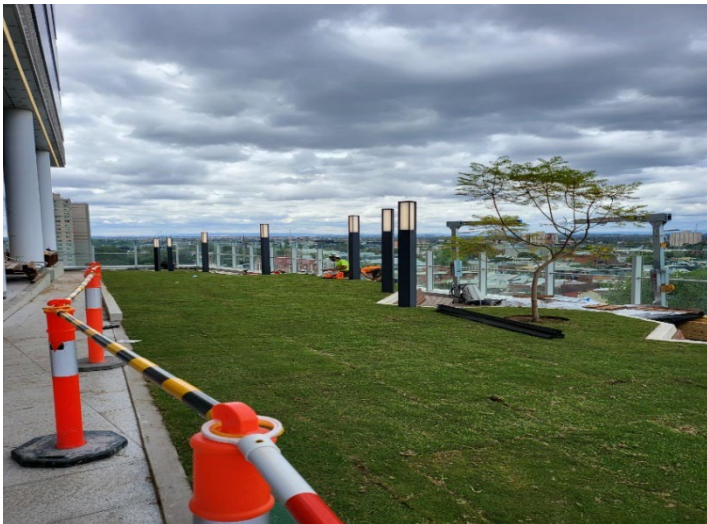
Level 6 Terrace