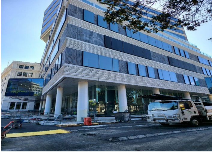
STKB from the corner of Napier St and Victoria Parade