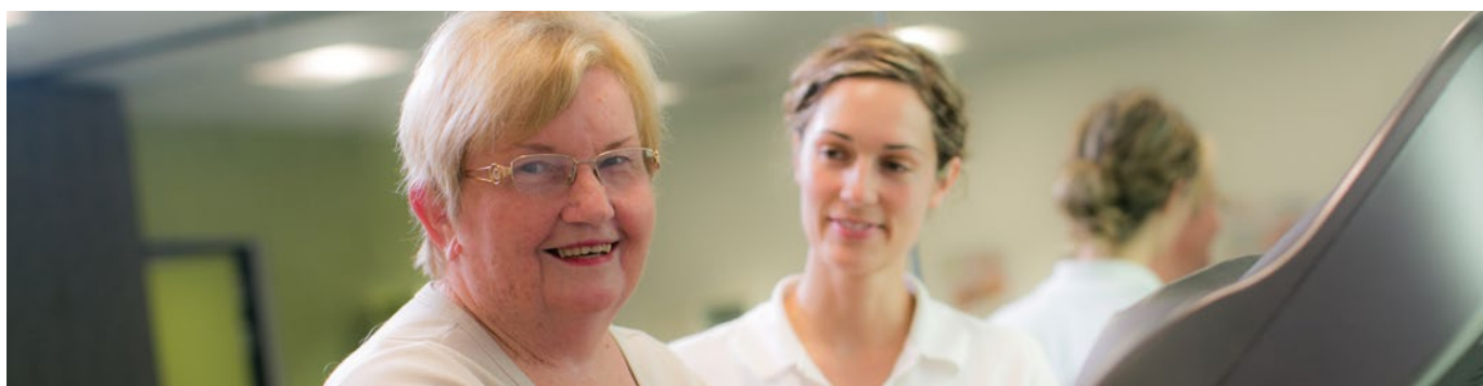
Student with client at ACU Health Clinic, Brisbane Campus

**Students will be required to attend workshop intensives in Brisbane to complete coursework units