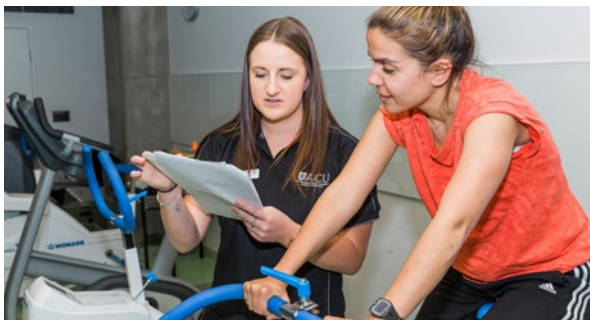
ACU students, Melbourne Campus