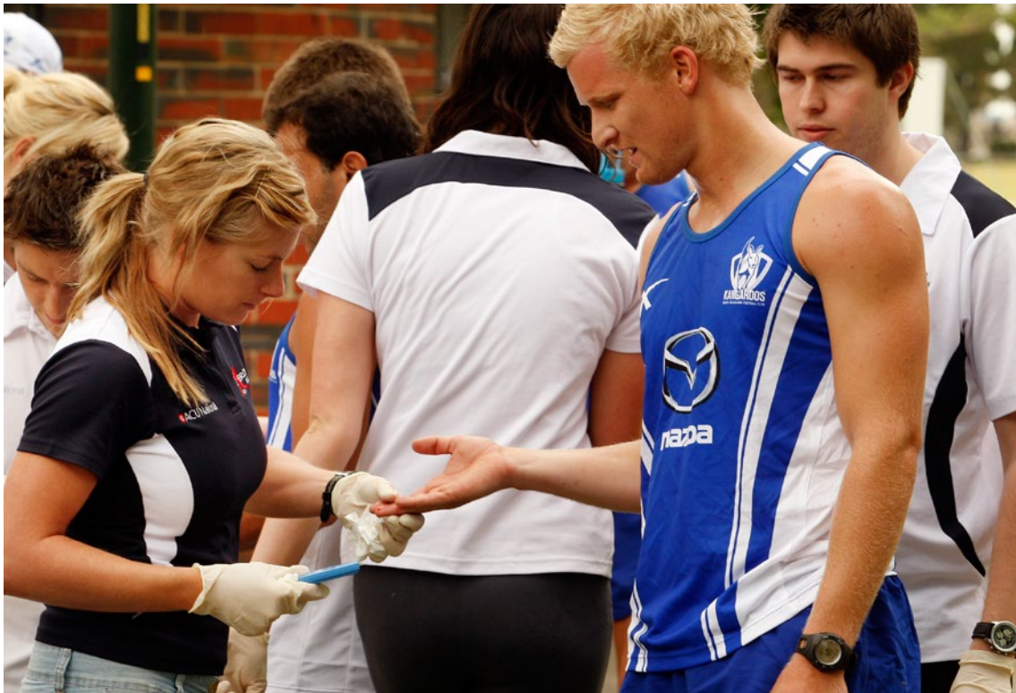
ACU Exercise science students