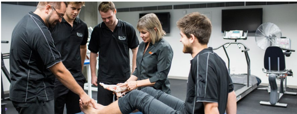
ACU students and staff, Melbourne Campus