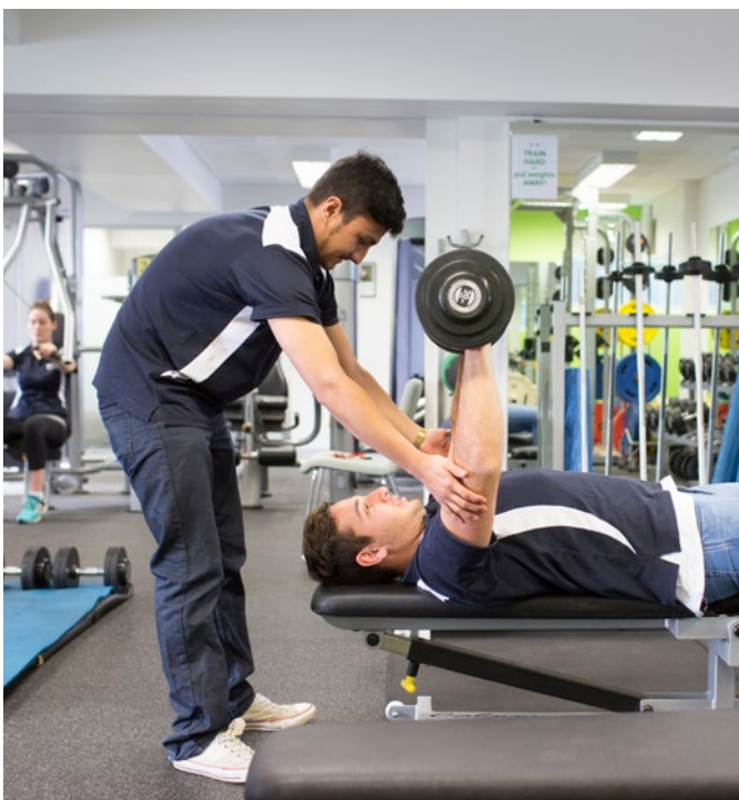
ACU students and staff, Strathfield Campus