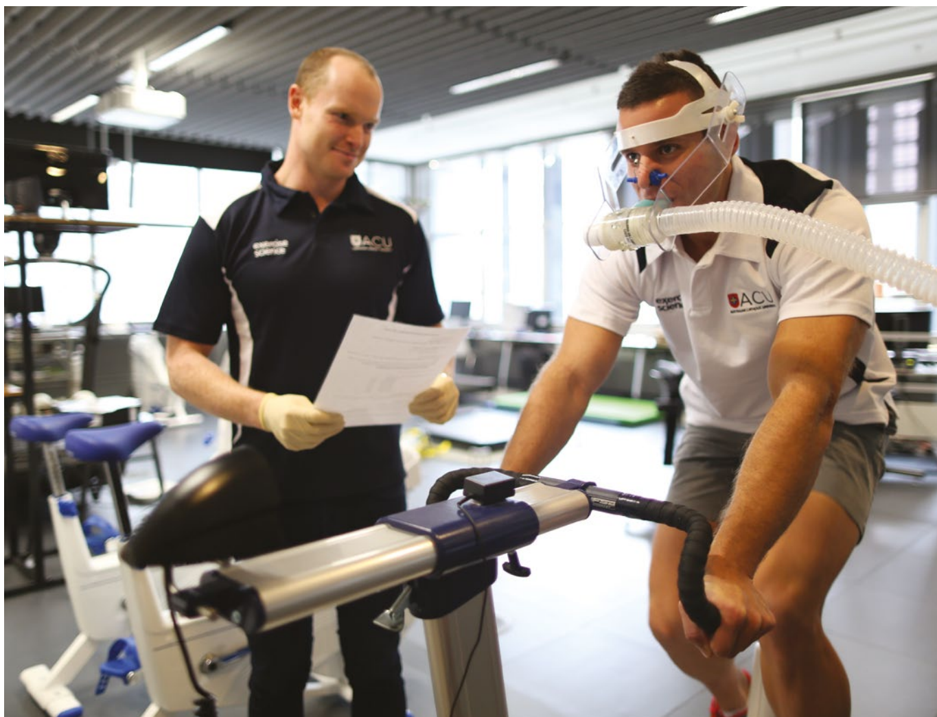
ACU students, Melbourne Campus

The research thesis permits students to undertake and report on research they have undertaken under the supervision team approved by the faculty's Associate Dean of Research. The research topic must offer sufficient scope to enable application of advanced reasoning skills within the context of the professionally orientated discipline and produce sufficient results to permit submission of an acceptable thesis. The thesis will normally be up to a maximum of 50,000 words in length.