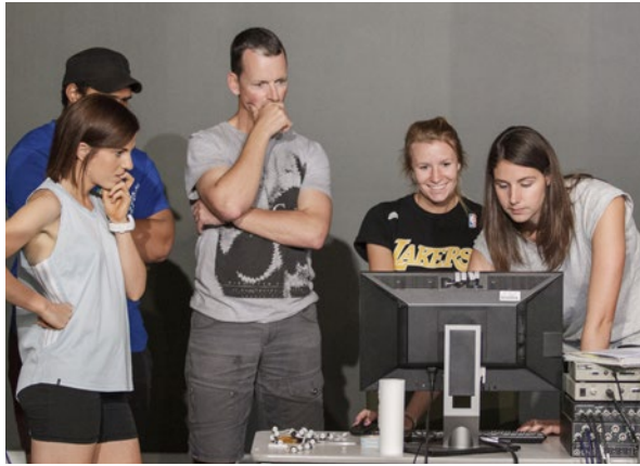
ACU students, Melbourne Campus