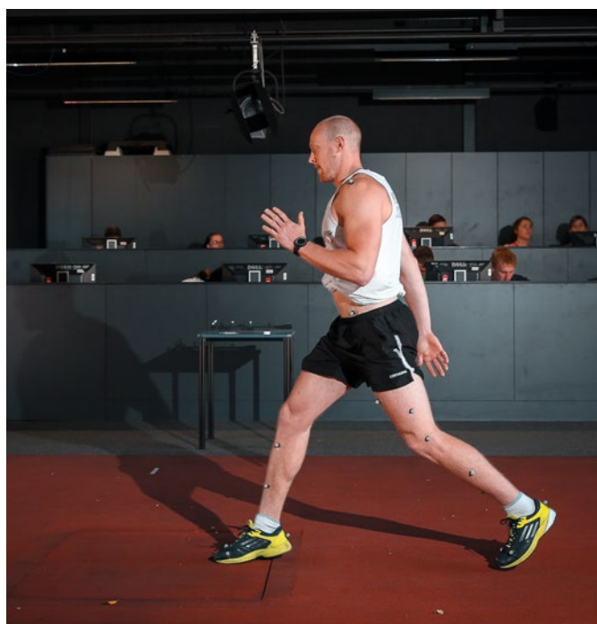
ACU student, Brisbane Campus

This unit addresses the application of performance analysis processes in high performance sport settings. Effective and creative approaches to data management, analysis, interpretation, and reporting are keys to successful implementation and outcomes in sporting organisations. The application of performance analysis practised in a variety of sporting contexts and problems will be examined.