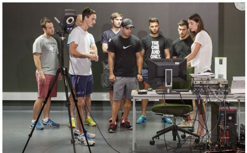
ACU students, Melbourne Campus