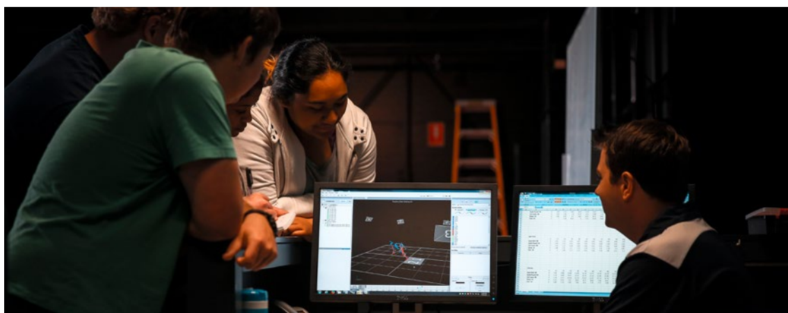
ACU students, Brisbane Campus

Units are delivered in a block over consecutive weekdays and/or weekends.