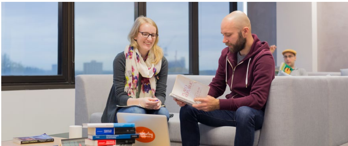
ACU students, Melbourne Campus

Units are delivered in a block over consecutive weekdays and/or weekends.