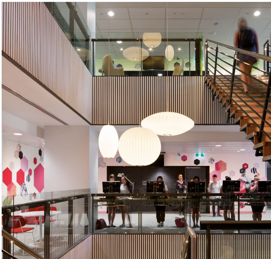
Raheen Library, Melbourne Campus

There is a strong connection between the research pursued by the institute and the learning and teaching that takes place across the faculty. Such a synergy is unique to the Faculty of Theology and Philosophy at ACU, and this is animated by a series of events. Held across all ACU campuses, including the Rome Campus, these events highlight the comprehensive network of international partnerships and collaborations, bringing faculty and institute staff together into critical dialogue with international scholars. The range of events on offer (including public lectures) also ensures that world-leading research is accessible to the ACU student body, and members of the general public.