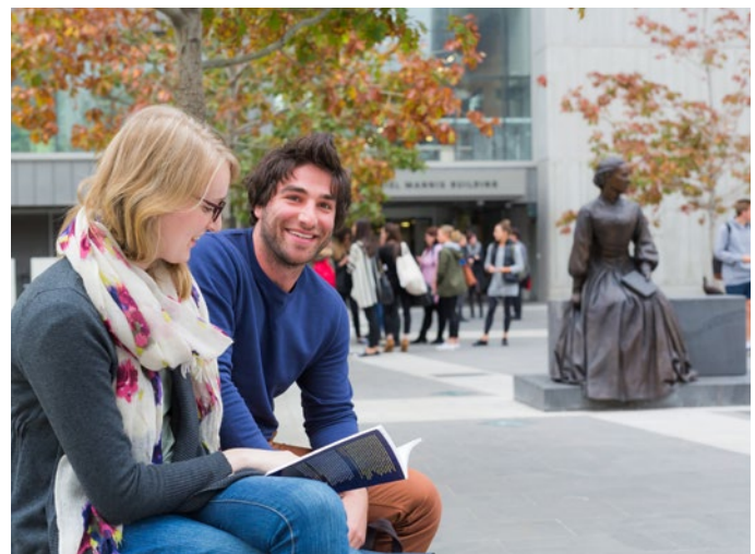
(Left) ACU students, Brisbane Campus, (Top right) Artwork, Canberra Campus, (Bottom right) ACU students, Melbourne Campus