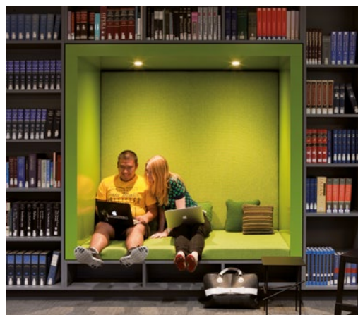
Raheen Library, Melbourne Campus