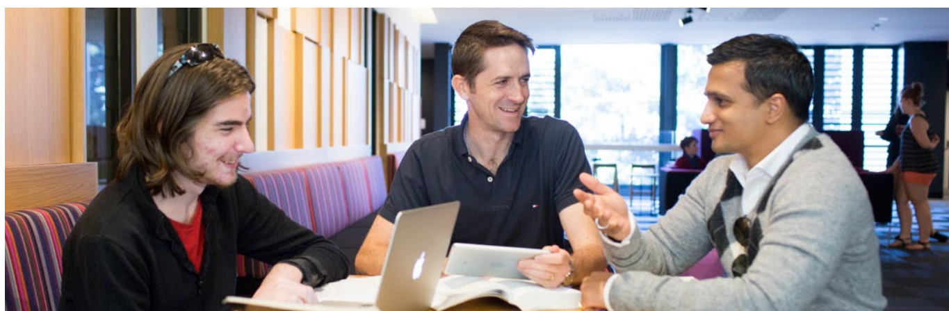
ACU students and staff, Brisbane Campus