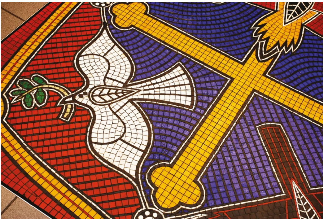
Mosaic floor tile